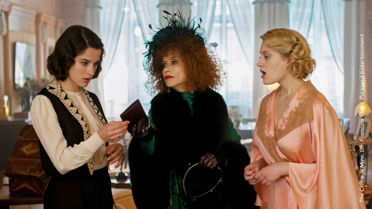
The Crime is Mine, Dir. Francois Ozon, Parkland Entertainment