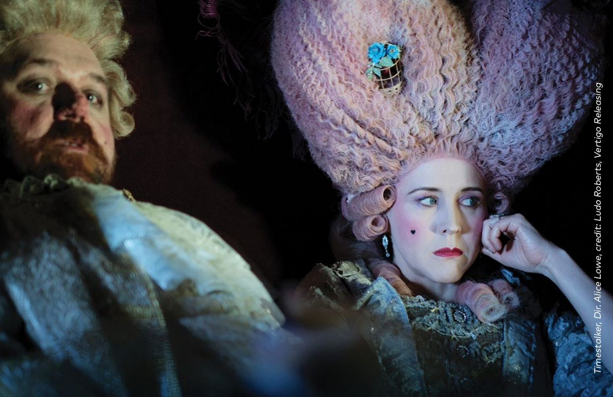
Timestalker, Dir. Alice Lowe