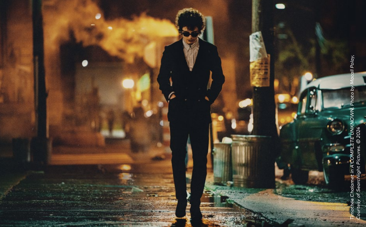
Timothée Chalamet in A COMPLETE UNKNOWN .