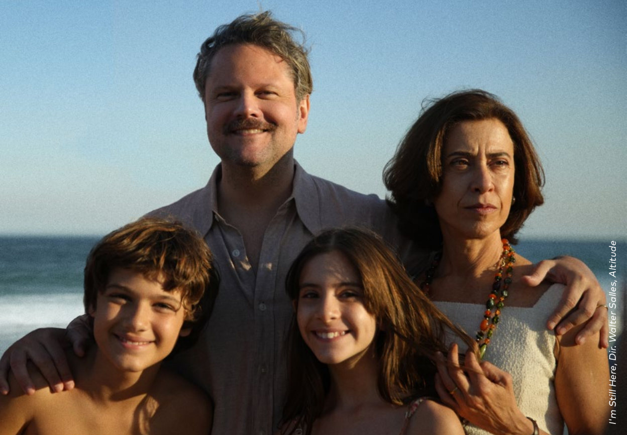
I'm Still Here, Dir. Walter Salles, Altitude