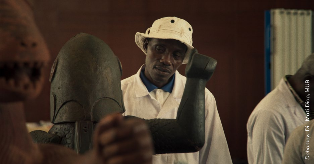
Dahomey, Dir. Mati Diop, MUBI