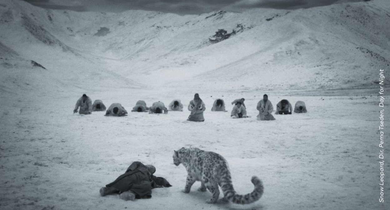
Snow Leopard, Dir: Pema Tsenden, Day for Night