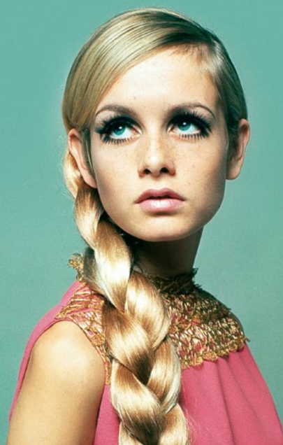
Twiggy, Dir. Sadie Frost, Studio Soho