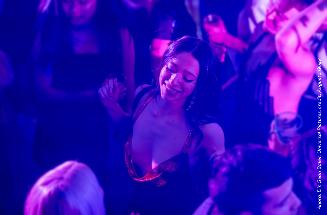
Anora, Dir. Sean Baker, Universal Pictures