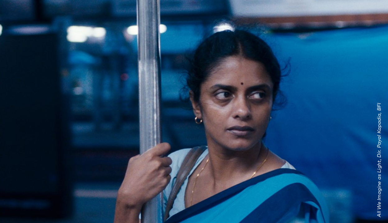
All We Imagine as Light, Dir: Payal Kapadia, BFI