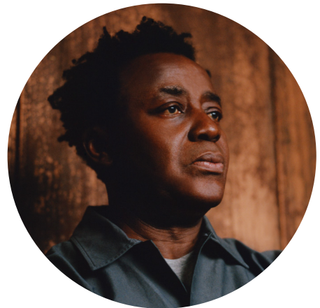
Sir John Akomfrah RA CBE

Akomfrah was awarded the Artes Mundi Prize in 2017 and a Knighthood for services to the Arts in the 2023 New Year Honours.